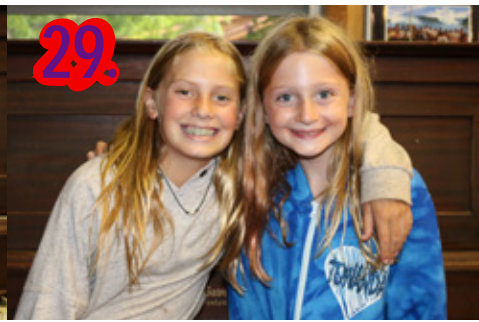
29. R. _____ L. _____