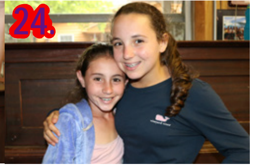
24. R. _____ L. _____