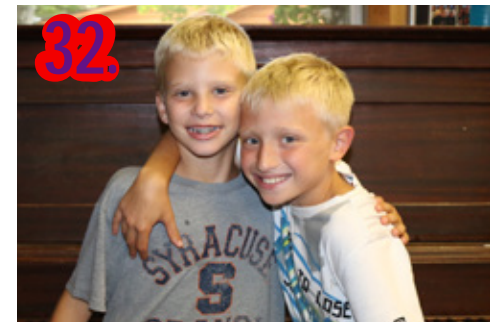
32. R. _____ L. _____