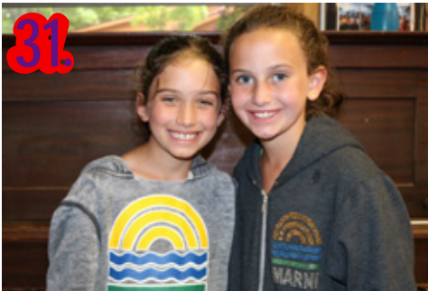
31. R. _____ M. _____